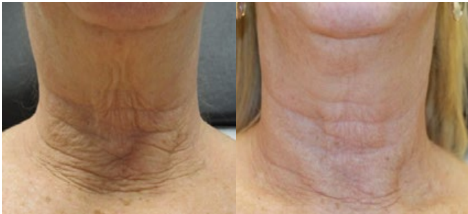
Before and after Lutronic Infini RF micro-needling for lines, wrinkles and thin skin

As a prescription-only treatment, Belkyra should only be administered by a registered doctor who has taken part in the official Belkyra training program run by Allergan-appointed experts.